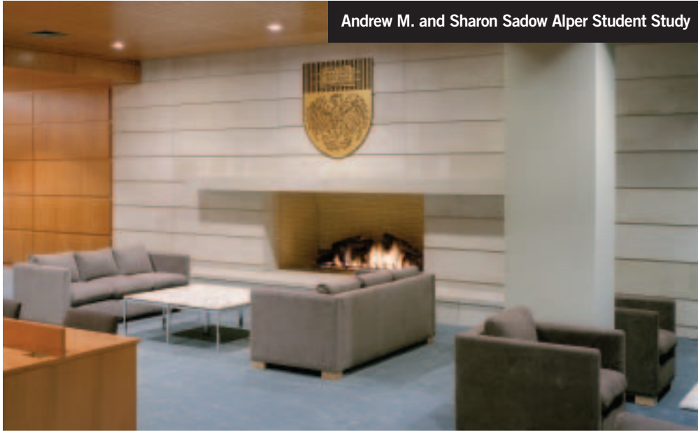
Andrew M. and Sharon Sadow Alper Student Study