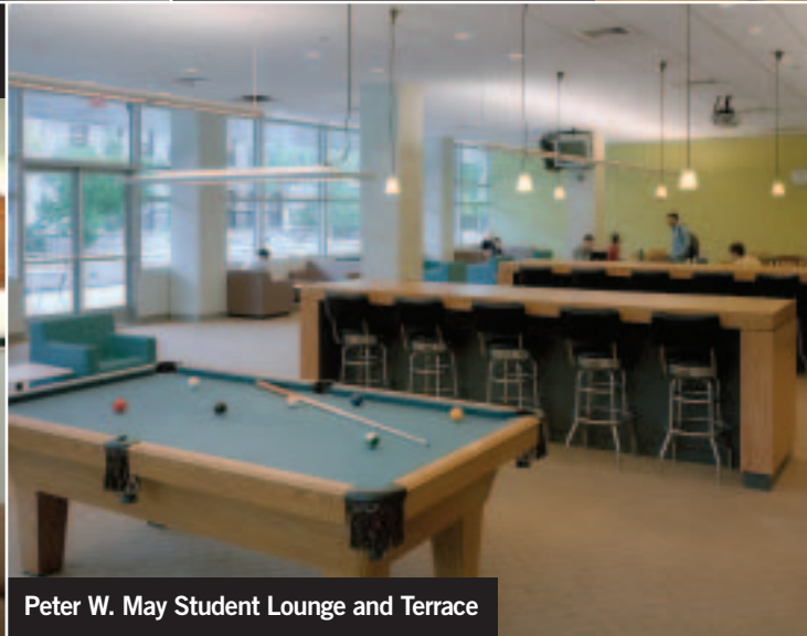
Peter W. May Student Lounge and Terrace