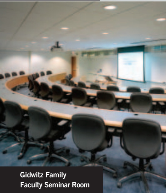
Gidwitz Family Faculty Seminar Room