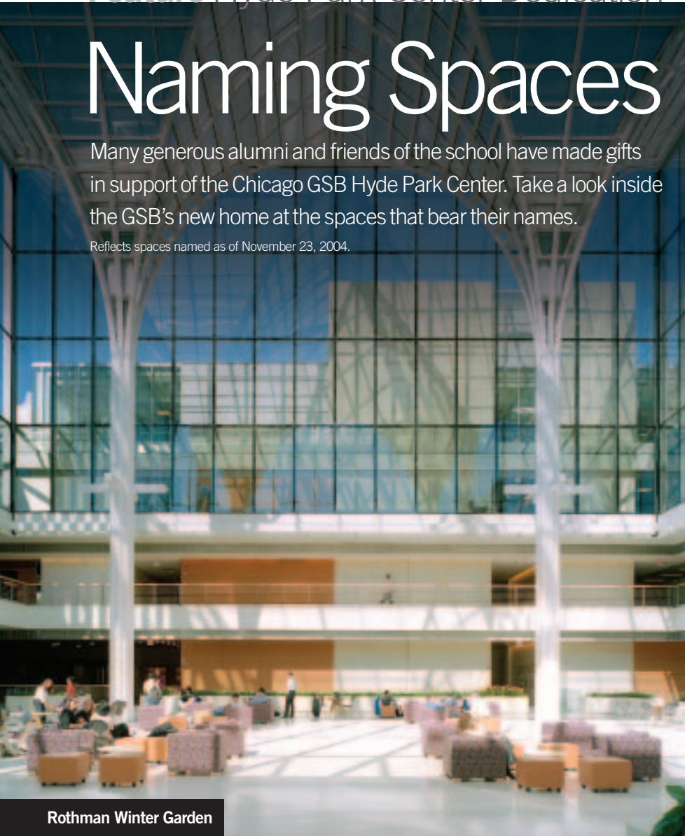
Rothman Winter Garden

Reflects spaces named as of November 23, 2004.