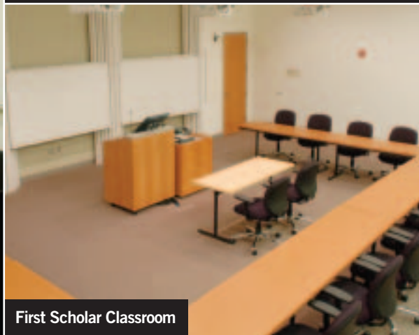
First Scholar Classroom