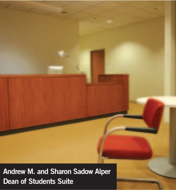
Andrew M. and Sharon Sadow Alper Dean of Students Suite