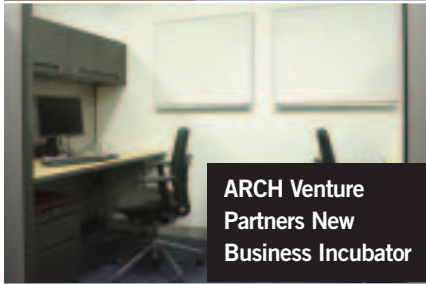
ARCH Venture Partners New Business Incubator