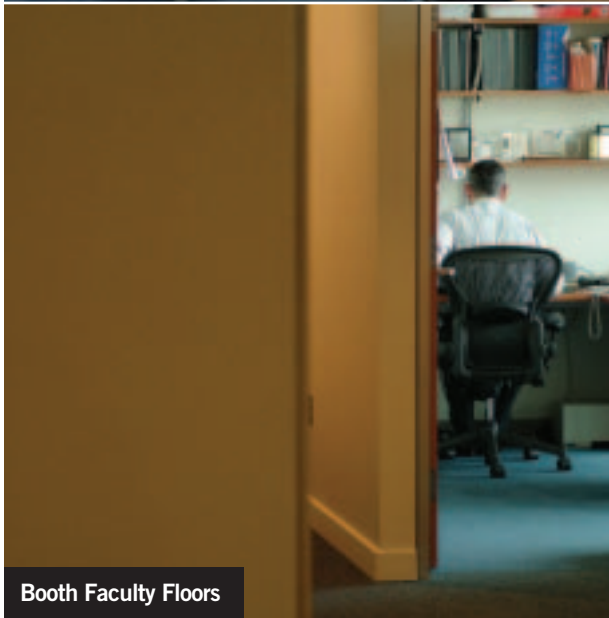
Booth Faculty Floors